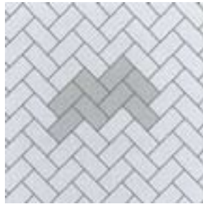
Pattern A (Herringbone) 100% Standard